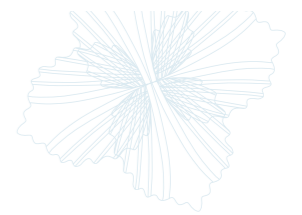
lobby level ground floor